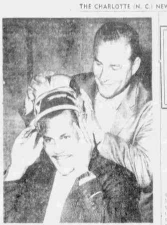
OLLIE MATSON IS A RAM