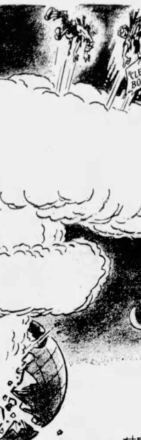
HERB RIPP, THE WASHINGTON POST