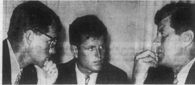
TED KENNEDY JOINED BROTHERS IN 1959 SENATE RACKETS COMMITTEE MEETING