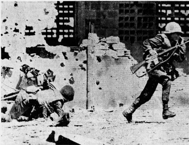
HIT BY ENEMY BULLET —A South Vietnamese trooper tries to crawl along bullet-riddled wall after being shot in the leg by a Viet Cong sniper during street battle in Saigon. A comrade dashes forward.