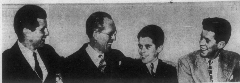
AMBASSADOR JOSEPH KENNEDY WITH SONS JOE, ROBERT AND JOHN IN 1939 Joe Died in World War II Air Crash; John Was Assassinated in 1963 and Robert Was Gravely Wounded by Would-Be Assassin Tuesday

At the heavily guarded American embassy secretaries and officials stood silent around radios and listened to the Armed Forces Radio bulletins from Los Angeles. A secretary in the political section bit her lip.