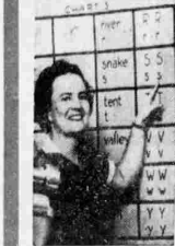
TV READING LESSON

Do you know anyone who cannot read or write? If so, here's your chance to do something about it. Free classes on television will teach reading and writing. Plans announcing this project will be found on Page 1C.