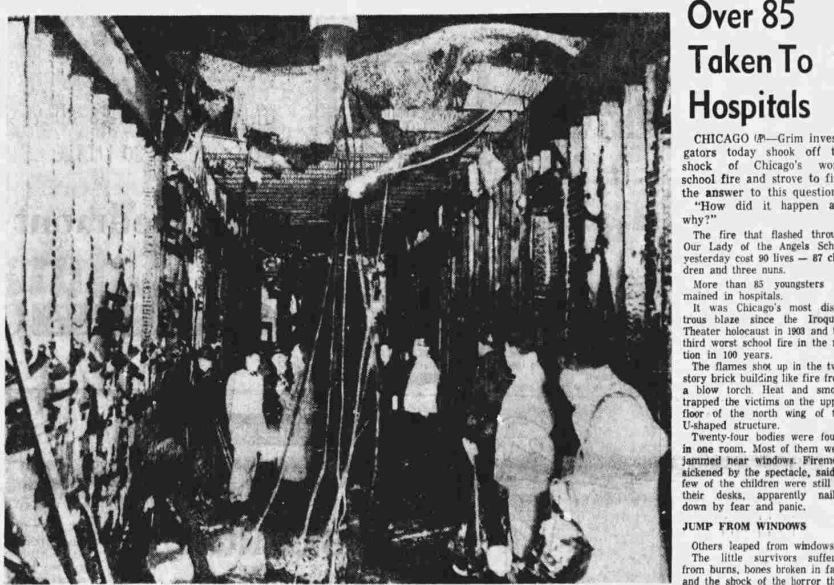
Officials Examine Charred Section Of Second Floor Where Roof Collapsed, Trapping Many