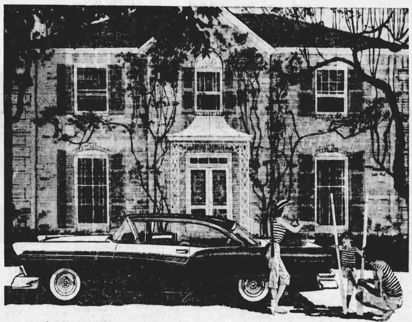
People who can easily pay any price say: