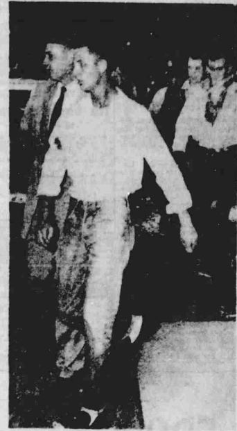
Police Escort Men From Little Rock School Vicinity

See Big Special Section Business ..... 12A, 5B Classified ..... 9-11B Comics ..... 8B Crossword Puzzle ..... 9A Earl Wilson ..... 6A Editorials ..... 8A Everyday Counselor ..... 7A Obituaries ..... 2-4B Radio-TV ..... 4B Serial ..... 8A Sports solution ..... 6B Theaters ..... 6A To Your Good Health ..... 4A Women ..... 7A Worry Clinic ..... 7A