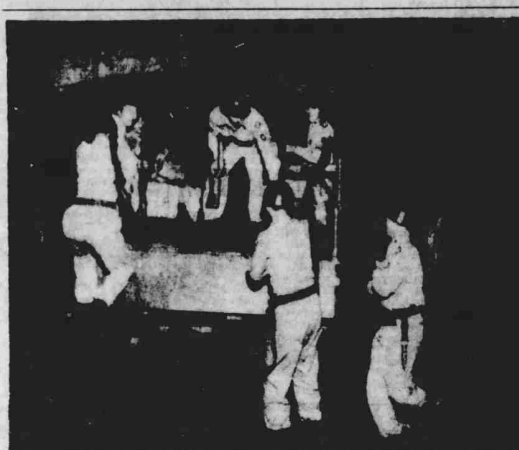
Guardsmen Leave Little Rock's Central High School After Gov. Faubus Ordered Them Out