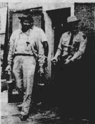
Officers Leave Basement With White Liquor.