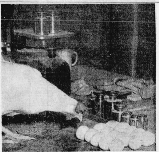
LUCY, The 2-year-old Leghorn who started the feathered week last week by laying 17 eggs in five days, looks rather disdainfully at a mere 15 eggs laid out before her by a Rutgers poultry physiologist. Her's trying to find out why Lucy hasn't produced another egg since her great effort last week.

"I am afraid they are also going to increase the interest rate," he said.