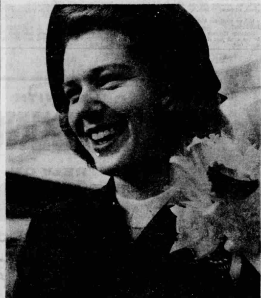
Miss America Smiles During Charlotte Stop En Route To Chester Christmas Parade

appeared into the water. It was a very appealing thought to me. Why can we view death without fear only when we are very young, very old or very sick?