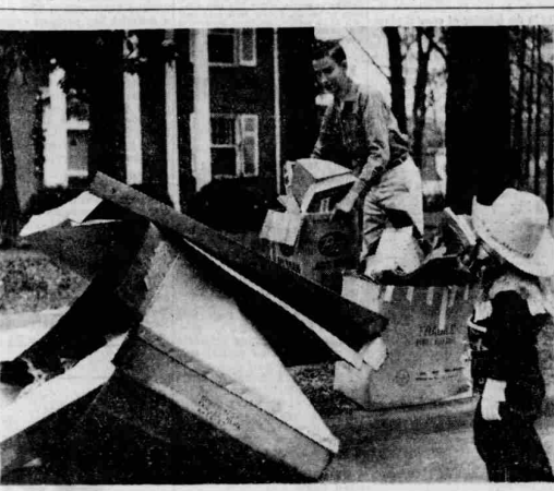
Sure Sign It's All Over

"My job is making Plexiglas canopies and cockpits for airplanes. I was a fighter pilot in the Second World War — flew Messerschmidt 109's. I have organized a soaring club here to fly sailplanes. We have our first big meeting tonight at my house."