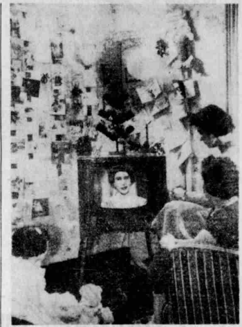
London Family Watches Telecast

Clearing this afternoon. Fair and cold tonight. Friday fair and cool. Low this morning—35 Low tomorrow morning—33 High today—50 High tomorrow—50 Sunrise today 7:30 a.m.; sunset today 5:17 p.m. More Weather Data on Page 2A