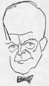
PRESIDENT EISENHOWER A Sobering Responsibility

Another veteran observer put the situation this way. Either Truman or Stassen is going to come out of this election a prophet; Democrats wouldn't listen to Truman telling them Stevenson couldn't win; Stassen is getting the huns rush with his doubts about Nixon.