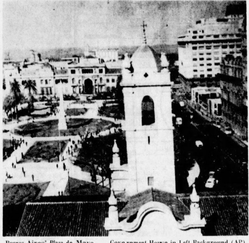
Buenos Aires' Plaza de Mayo... Government House in Left Background

It could not evolve a plan acceptable to both sides within 90 days more, an arbitrator will take over.