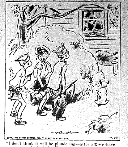
"I don't think it will be plundering—a fair gift we have to feed the liberated peoples!"

Truman Gets Sure Shortly before he left for Europe, President Truman was informed of what the Army-Navy were doing and how they were still buying more, although no one knew but the Army and Navy are afraid Congress won't give them anything after the war, so they are hoarding up a huge post-war program now.