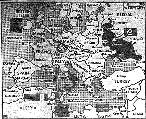
RESUME OF ALLIED ADVANCES AGAINST AXIS IN 1943 — The black areas on the map indicate the territory won by the Allies in their fight against the Axis in Europe and North Africa during 1943. The push up from North Africa resulted in the surrender of Italy. As the year drew to a close Allied forces were gathering for an attack on Germany from the west.